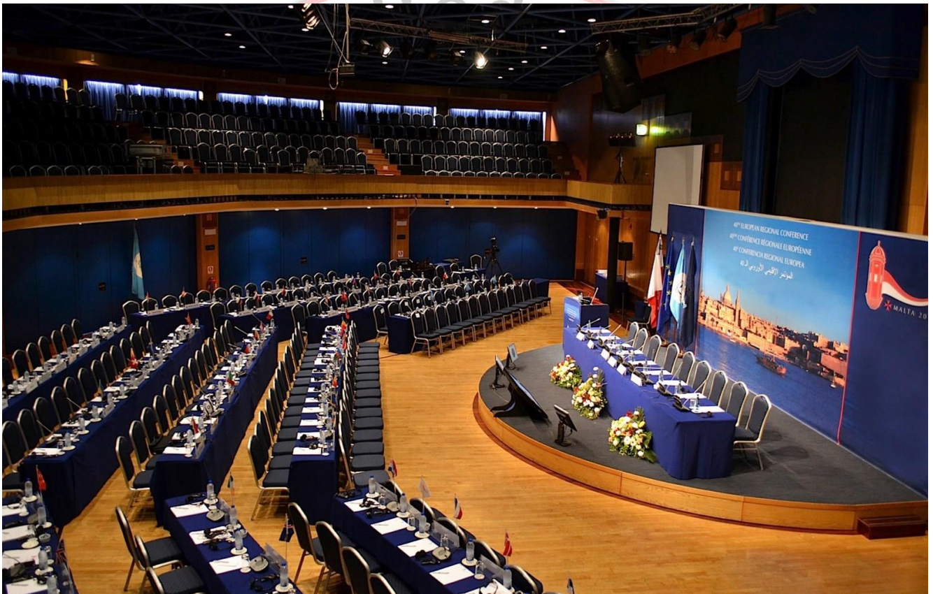
The Oracle Conference Centre-Dolmen Resort Hotel Malta

The Dolmen Hotel Prides with its State-of-the-art "ORACLE CONFERENCE CENTRE" that has a seating capacity for 1,200 delegates.