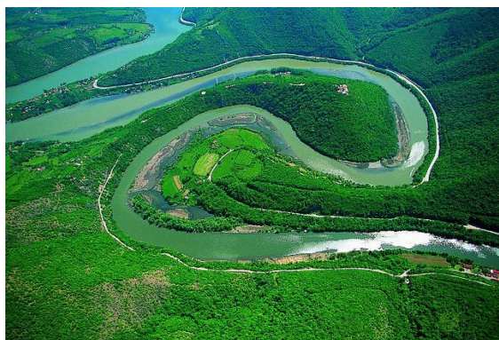
Ovcara-Kablar Gorge near Čačak

It may as well be concluded that a town like Čačak, surrounded by such dazzling slopes of Jelica, Vujan, Ovcara and Kablar, has a surplus of natural attractions. When speaking about the Ovcara-Kablar canyon, its monasteries are of exceptional beauty, and sights that shouldn't be missed! Of course, there is the "Grujine livade" picnic site, situated on the Jelica Mountain, and unavoidable healing waters of Ovcara, Slatina and Gornja Trepča spas. The latter being famous for its mineral water, thus often referred to as the "Atomic spa".