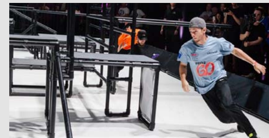
World Chase Tag