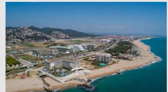
Accommodation Area Fitness Sports Games Village Competition