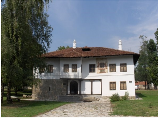
The National Museum in Cacak