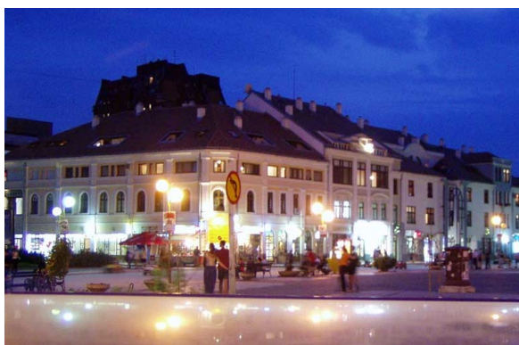
Cacak by night