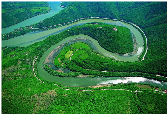
Ovcara-Kablar Gorge near Cacak

It may as well be concluded that a town like Cacak, surrounded by such dazzling slopes of Jelica, Vujan, Ovcara and Kablar, has a surplus of natural attractions. When speaking about the Ovcara-Kablar canyon, its monasteries are of exceptional beauty, and sights that shouldn't be missed! Of course, there is the "Grujine livade" picnic site, situated on the Jelica Mountain, and unavoidable healing waters of Ovcara, Slatina and Gornja Trepca spas. The latter being famous for its mineral water, thus often referred to as the "Atomic spa".