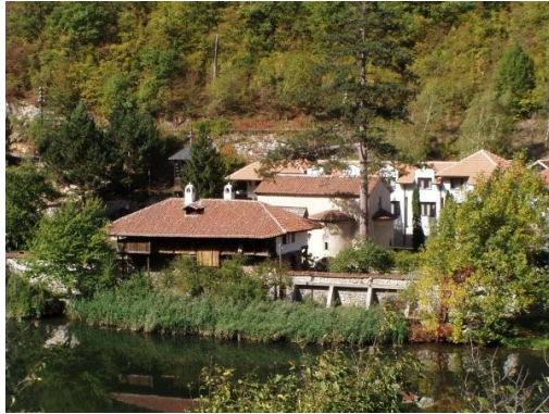
The Nikolje Monastery