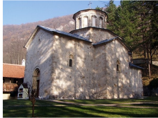
The Monastery of the Holy Trinity