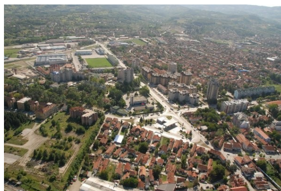
Cacak from the air