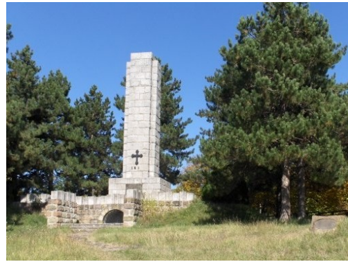
The Tanasko Rajić monument