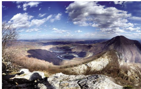
View from Kablar mountain