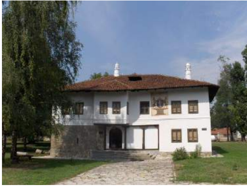
The National Museum in Cacak