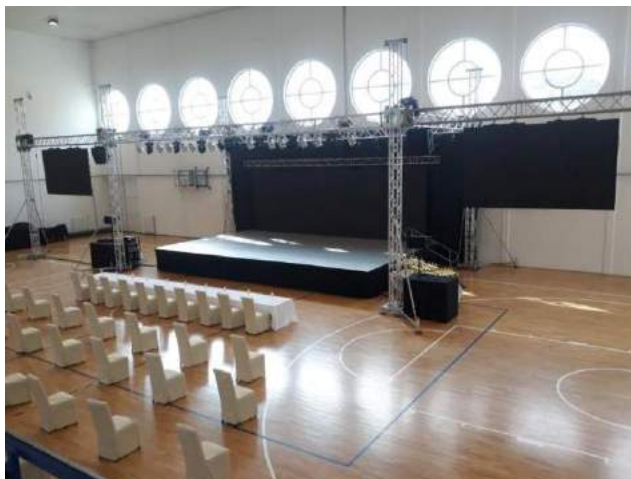
SPORTS HALL OF THE "ZRAČAK" INSTITUTION NUŠIĆEVA 24, ČAČAK