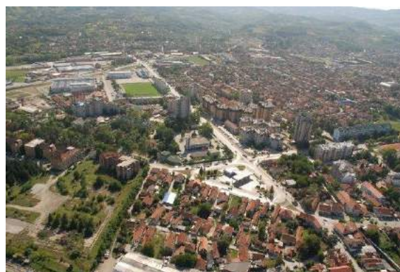
Cacak from the air