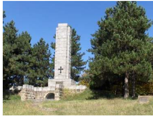
The Tanasko Rajić monument