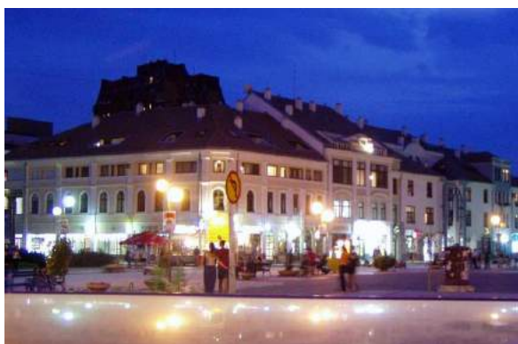
Cacak by night