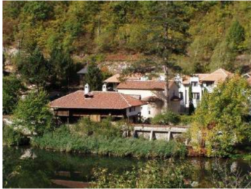
The Nikolje Monastery