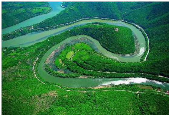
Ovcara-Kablar Gorge near Cacak

It may as well be concluded that a town like Cacak, surrounded by such dazzling slopes of Jelica, Vujan, Ovcara and Kablar, has a surplus of natural attractions. When speaking about the Ovcara-Kablar canyon, its monasteries are of exceptional beauty, and sights that shouldn't be missed! Of course, there is the "Grujine livade" picnic site, situated on the Jelica Mountain, and unavoidable healing waters of Ovcara, Slatina and Gornja Trepca spas. The latter being famous for its mineral water, thus often referred to as the "Atomic spa".