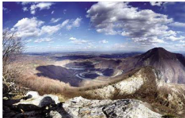
View from Kablar mountain