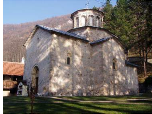
The Monastery of the Holy Trinity