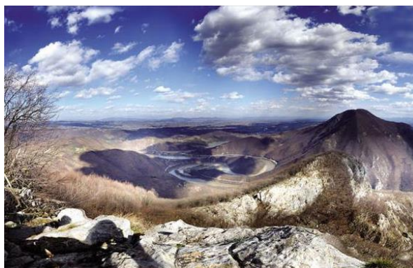
View from Kablar mountain