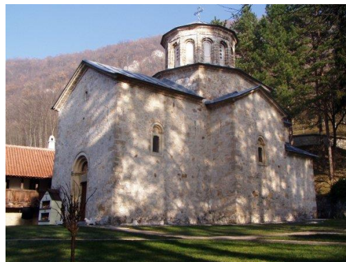
The Monastery of the Holy Trinity