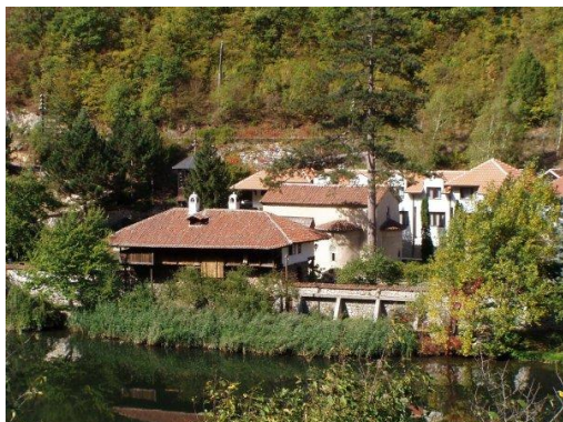
The Nikolje Monastery