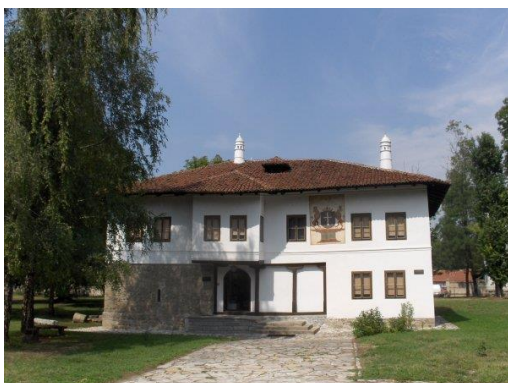
The National Museum in Čačak