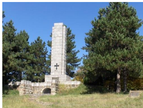
The Tanasko Rajić monument