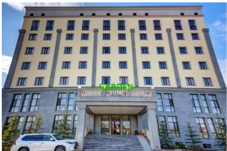
● «GARDEN SPA» 61 Emilbek Ailchiev St