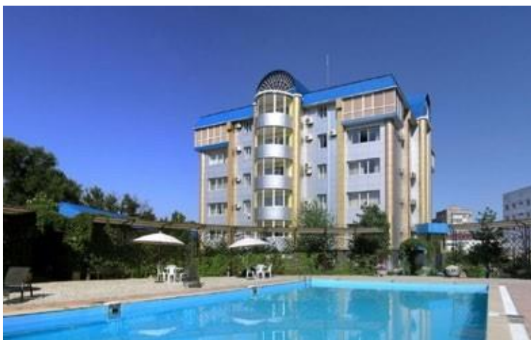
● «GOLDEN DRAGON» 60 Elebaeva St