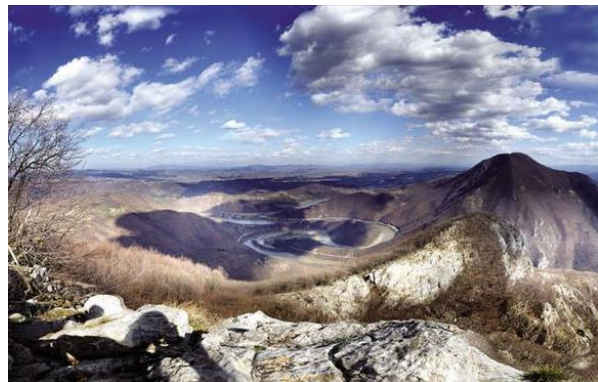
View from Kablar mountain