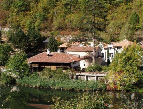
The Nikolje Monastery