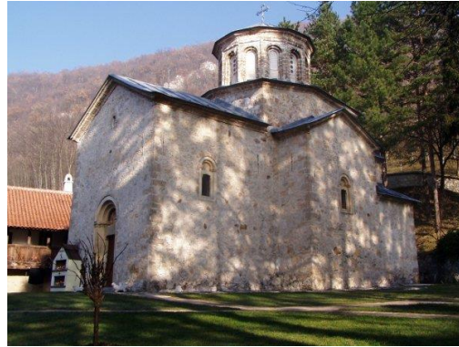
The Monastery of the Holy Trinity