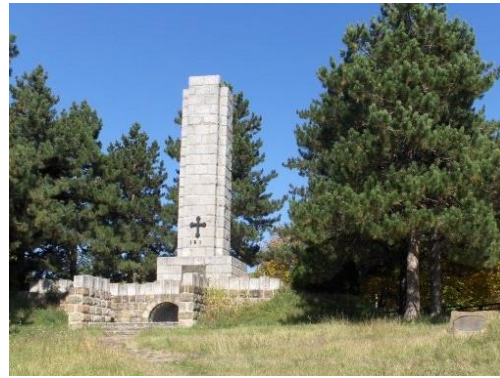
The Tanasko Rajić monument