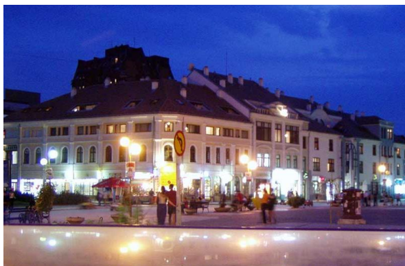
Čačak by night