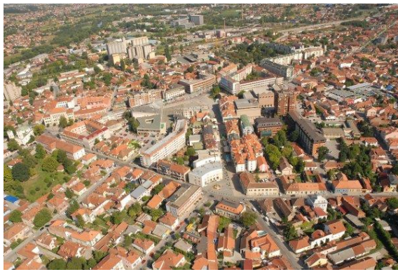
Čačak from the air

As far as “newer history” is concerned, a protected natural attraction, packed with monasteries and churches and known as the Ovčar-Kablar canyon, lies near Čačak, making it the holy ground of Serbia. A neighboring town of Dragačevo, is placed nearby as well, and it is the venue of the famous Guča festival. Each year, the festival is visited by over half a million people.