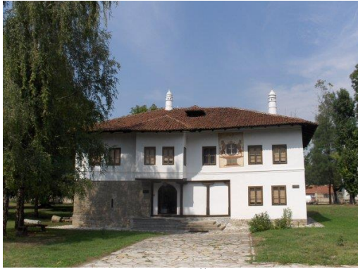
The National Museum in Čačak