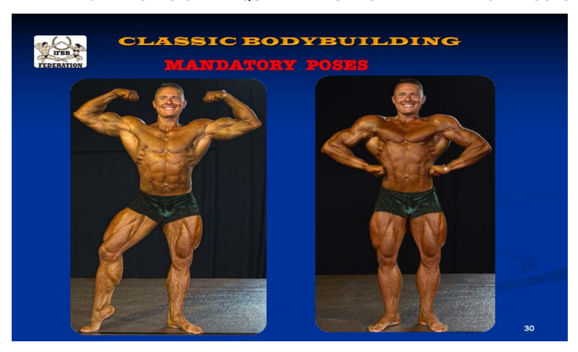
APPENDIX 3: PICTURES OF ALL QUARTER TURNS AND MANDATORY POSES

Erect stance, head and eyes facing the same direction as the body, heels together, feet inclined outward at a 30° angle, knees together and unbent, stomach in, chest out, shoulders back, head up, right arm hanging slightly back from the centerline of the body with a slight bend at the elbow, thumb and fingers together, palm facing the direction of the body, hand clenched into a fist, left arm slightly bent at the elbow to the front of the body, palm facing the body, hand clenched into a fist. The positioning of the arms will cause the upper body to twist slightly to the right, with the right shoulder lowered and the left shoulder raised. This is normal and must not be exaggerated. Competitors who fail to adopt the proper stance will receive one warning after which points will be deducted from their score.