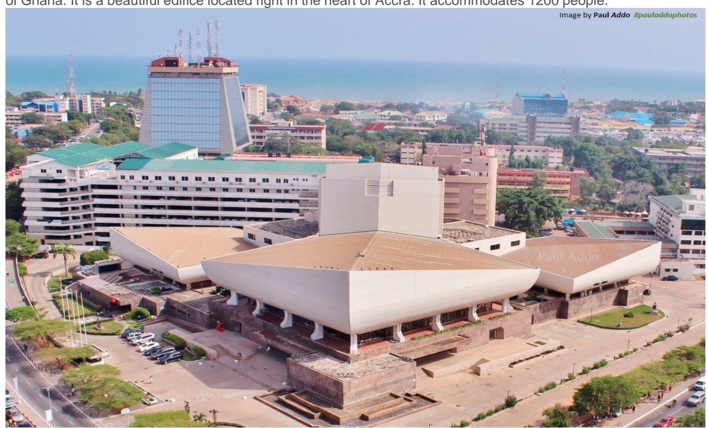
OUTER-LOOK OF THE VENUE

The National Theatre was opened in 1992 to spearhead the Theatre movement in Ghana by providing a multifunctional venue for concerts, dance, drama and musical performances, screenplays, exhibitions and special events. It is jointly built by the Government of the People's Republic of China and the Government of the Republic of Ghana. It is a beautiful edifice located right in the heart of Accra. It accommodates 1200 people.