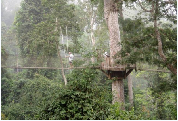
Experience a canopy walk

Cape Coast Castle is a fortification in Ghana built by Swedish traders. The first timber construction on the site was erected in 1653 for the Swedish Africa Company and named Carolusborg after King Charles X of Sweden. It was later rebuilt in stone.