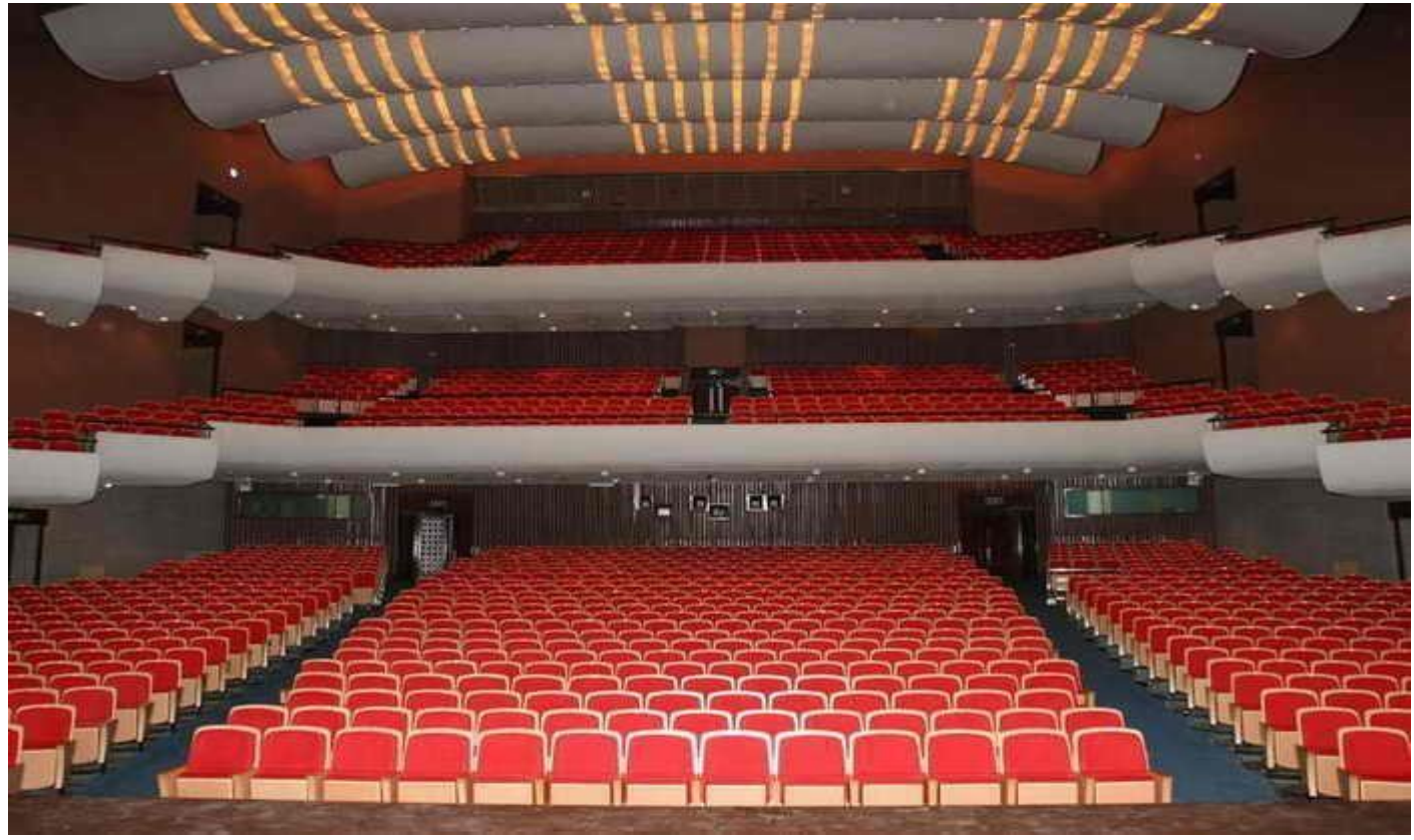
INNER-LOOK OF THE VENUE