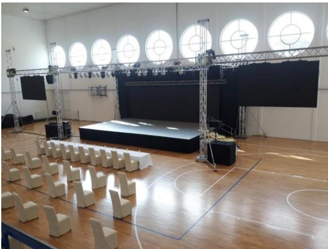
Stage dimensions 10x10 m with fitness tatami mats SPORTS HALL OF THE "ZRAČAK" INSTITUTION NUŠIČEVA 24, ČAČAK