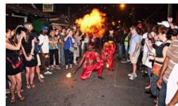
Friday Night Street Party