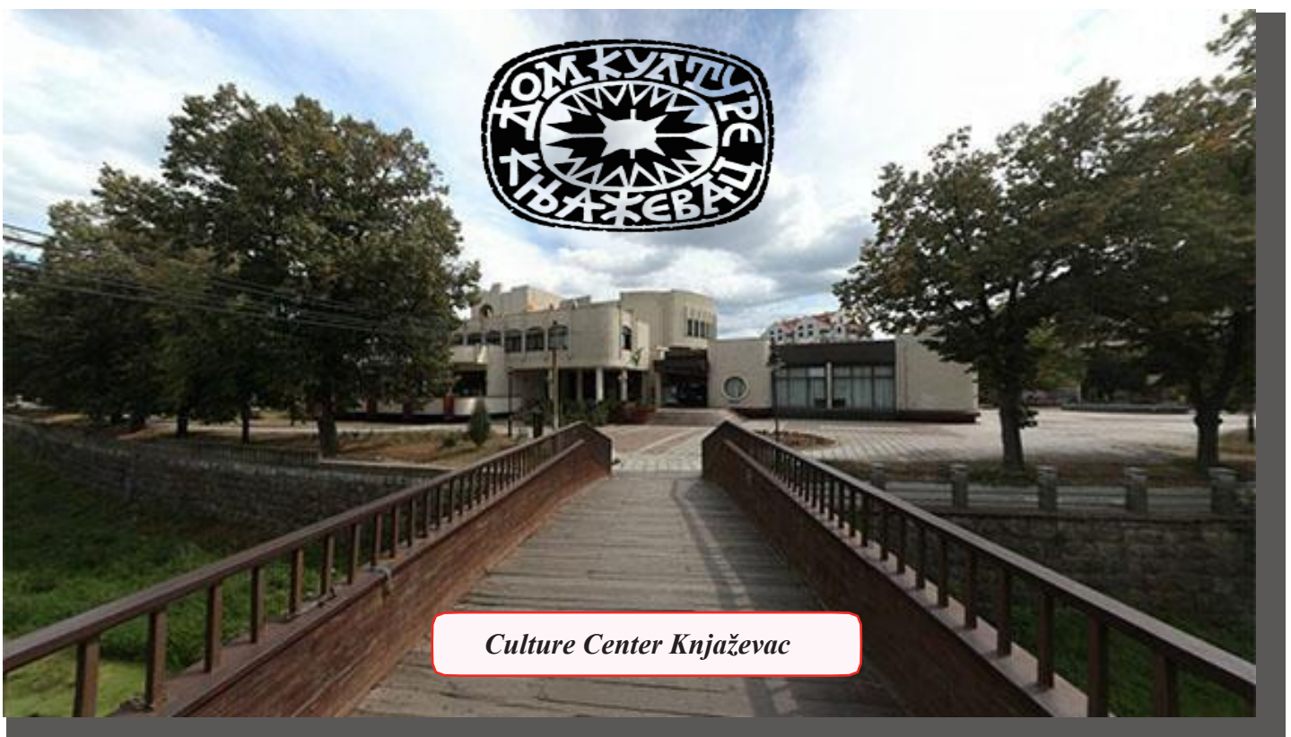
Culture Center Knjaževac