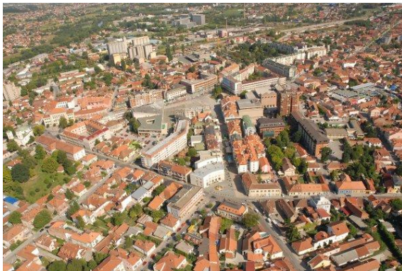
Čačak from the air

As far as “newer history” is concerned, a protected natural attraction, packed with monasteries and churches and known as the Ovčar-Kablar canyon, lies near Čačak, making it the holy ground of Serbia. A neighboring town of Dragačevo, is placed nearby as well, and it is the venue of the famous Guča festival. Each year, the festival is visited by over half a million people.