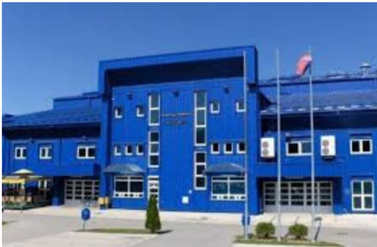
Stage dimensions 10x10 m with fitness tatami mats SPORTS HALL OF THE "MLADOST", Gradski Bedem 2, ČAČAK